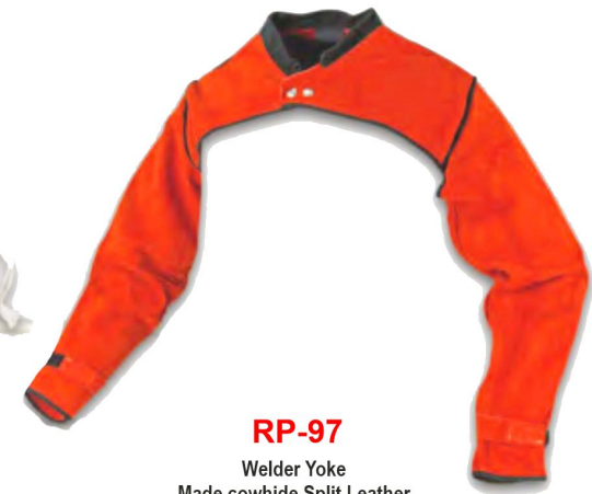
RP-97 Welder Yoke Made cowhide Split Leather Sewn Kevlar®