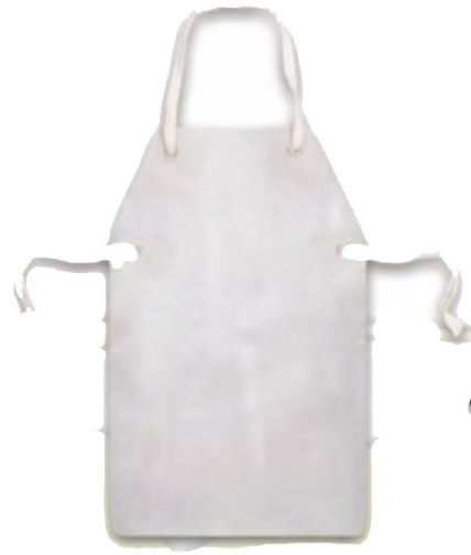
RP-96 Welder Bib Apron Made cowhide Split Leather