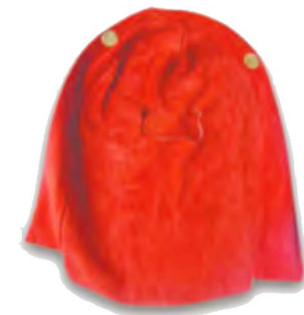
RP-102 Welder Helmet Cap Made cowhide Split Leather Sewn Kevlar®