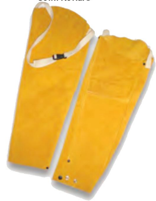
RP-98 Welder Sleeve Made cowhide Split Leather Sewn Kevlar®