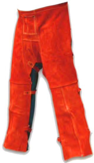
RP-93 Welder Chaps Made cowhide Split Leather Sewn Kevlar®