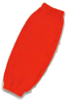
RP-99 Welder Sleeve Made cowhide Split Leather Sewn Kevlar®