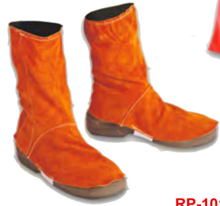
RP-101 Welder Shoe Cover Made cowhide Split Leather Sewn Kevlar®