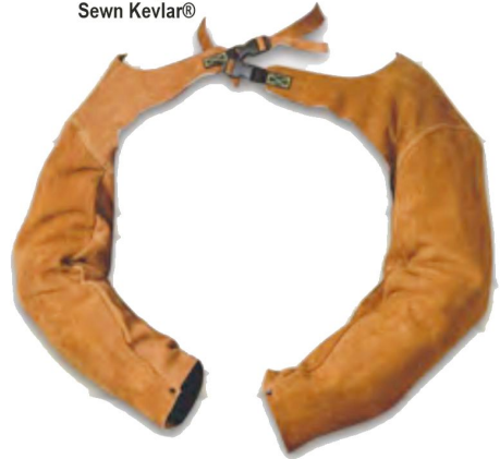
RP-100 Welder Sleeve Made cowhide Split Leather Sewn Kevlar®