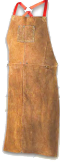
RP-95 Welder Bib Apron Made cowhide Split Leather Sewn Kevlar®