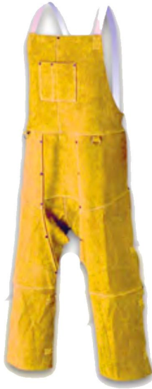
RP-94 Welder Bib / Chaps Made cowhide Split Leather Sewn Kevlar®